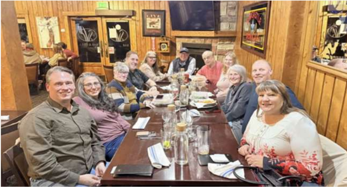
First dinner out at Bluebird Restaurant at Spring Valley Gold Club

Do you have an idea you'd like to explore? Reach out to the new community Facebook group (link above) and let's help bring it together. You can also email karpssk15@gmail.com or karpcbk15@gmail.com if Facebook isn't your thing.